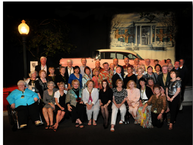
Class of 1963, Memphis 2010

Our first dinner with part of the group was to Marlow's BBQ restaurant on Monday night. The restaurant sent pink Cadillac's to pick us up and then return us to the hotel. (con't on page 12)