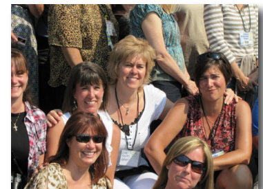
Top: Rhein River Cruise!