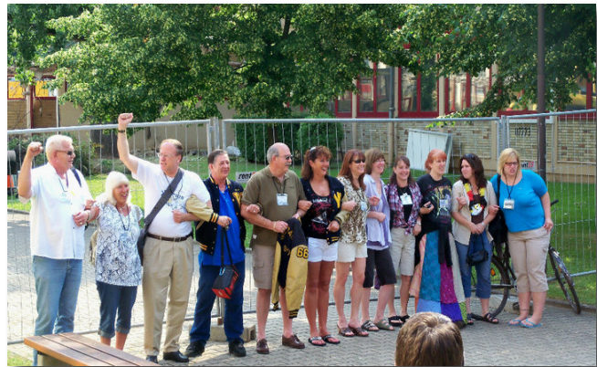
Top: Early to mid 80s Warriors standing outside the old cafeteria in Hainerberg.